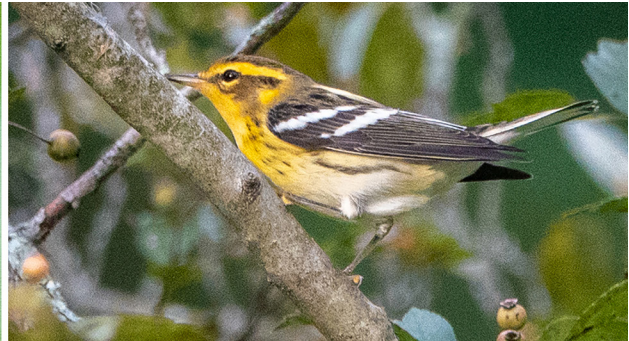
Black-and-White Warbler (left) and Blackburnian Warbler (right)