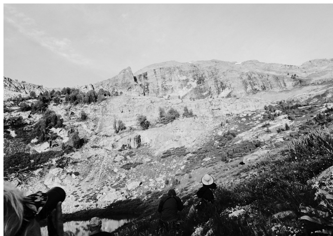
Himalayan Snowcock finally appeared atop this ridge in the Ruby Mountains, seen here from Island Lake.

We were up early the next day to do our next acclimatization trek, this time in the Ruby Mountains, but not the trail we would take for the Snowcock. The Lamoille Lake trail hike was intended to be a few hours, but the day was so nice that we ended up hiking to Lamoille Lake, a two-mile hike up to 9700+ feet, almost a duplicate of the real trek that we would do the next day. We saw some birds, including Clark’s Nutcracker, and were delighted by the myriad of wildflowers along the trail.