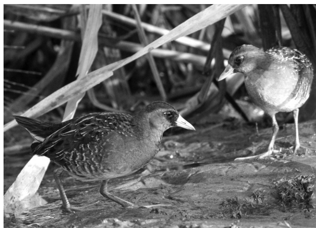
A pair of Soras, two of an amazing 23 seen on the Patuxent River Park trip on September 6.

A short late-morning walk also found some nice birds despite heat that reached the low 90s. Most interesting was a Scarlet Tanager far along in molt, with just a bright red belly set off by yellow underparts and black wings. It was pursued by a begging young tanager. We had brief glimpses of a thrush species and a probable Ovenbird. There were better looks at Black-and-White Warbler and Solitary Sandpiper. A Yellow-throated Vireo and several Pewees and White-eyed Vireos provided songs in the background.