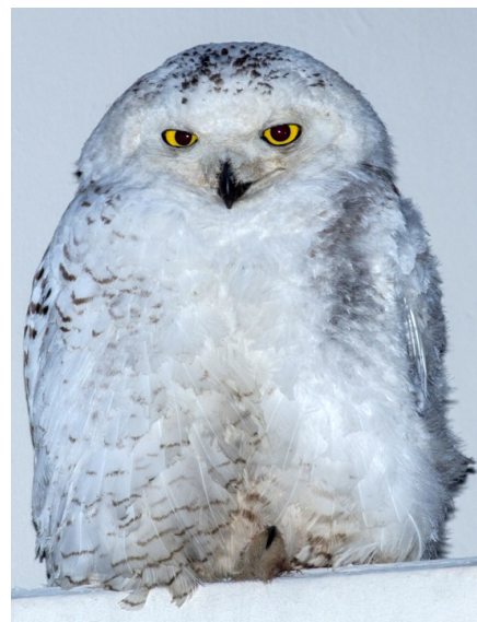
The "Washington Post" Snowy Owl on 1/24/14. A Snowy Owl (perhaps the same bird) was found injured in D.C. on 1/30 and is being rehabbed at the National Zoo in hopes that she can be released.

The irruption is thought to be the result of a banner nesting season, and the majority of the owls being banded are healthy. ♪